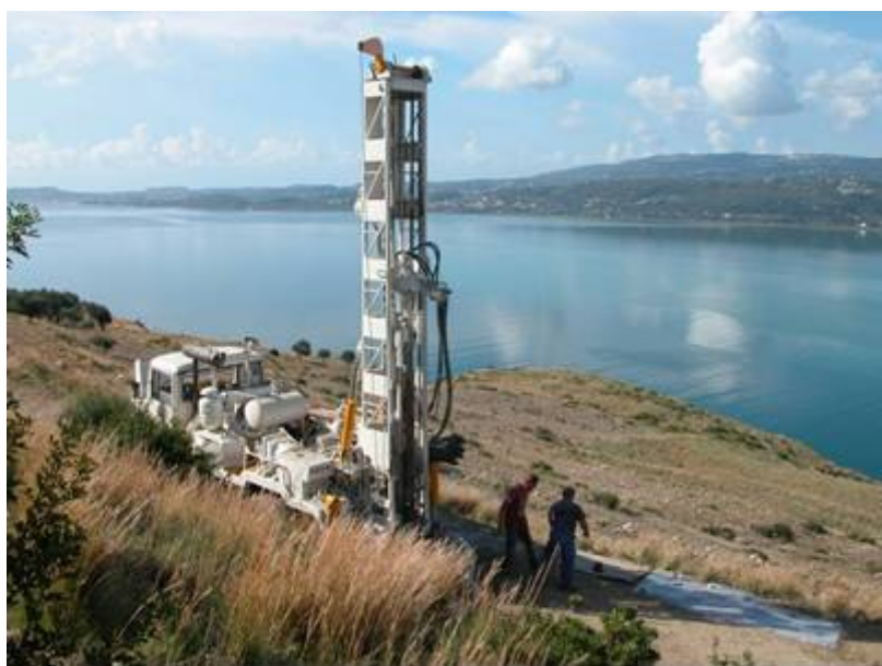
Figure A6.4: Drilling the 122 metre (400 foot) test borehole

In October 2006 a trial borehole was drilled in Thinia towards the southern exit of the predicted channel course (Figure A6.4) and the results of this and other tests were announced in January 2007. The elevation of the borehole above sea level was 107.6 metres and on both its western and eastern margins there is solid limestone bedrock of the Paleogene period (from 65 to 24 million years old). Further to the east there is bedrock of the Cretaceous period (between 144 and 65 million years old). The test drilling itself took place at the end of an unpaved road that is abruptly cut off on its northern limit by a landslide that can be dated to within the last few centuries.