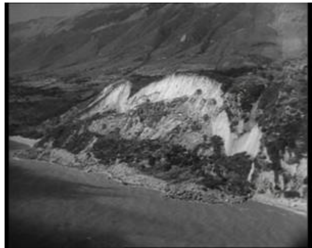
Fig. A6.3a & b: Cliff collapse on Kefalonia after the 1953 earthquake.